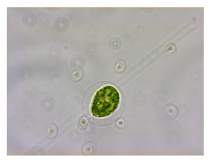
Fig. 3. Flagellate macrozoid stage of Haematococcus pluvialis

The noticeable red coloration within the algal cells that covered the walls of the pool indicated the developmental stage of Haematoccocus pluvialis (Fig. 1). Microscopic analysis showed that the resting hematocyst stage of H. pluvialis was responsible for