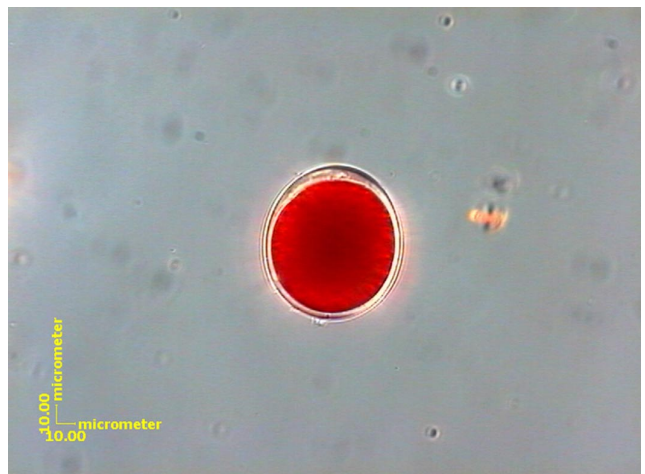
Fig. 2. Resting hematocyst stage of Haematococcus pluvialis

the red coloration. These hematocysts had an oval shape, a thickened cell wall and no flagella (Fig. 2). It is during this stage that the cells hematocysts contain large amounts of astaxanthin.