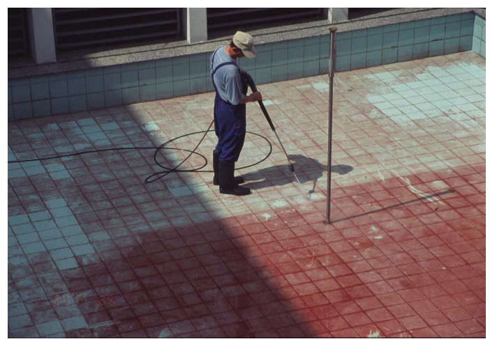
Fig. 1. Haematococcus pluvialis in a small artificial pool on the university campus of the Collegium Biologicum in Poznań

dimensions of 4 x 5 metres. Surface layers of algae attached to the walls of pool were removed and placed in a glass container. Species identification was determined using light microscopy (magnification 1000x) with Nomarskii contrast, according to Rothmaler et al. (1994). Photographs were taken and saved for documentation using Zeiss software KS 300. Pigment analysis and their distribution within the cells were examined using a conphocal microscope. The surface structure of the resting cell wall was determined using a scanning electron microscope. The resting stages of H. pluvialis were cultured using WC media and incubated under a 12:12 light and dark regime at 23°C.